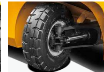
Steering bridge, tires