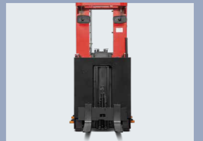
Supplementary lift on operator platform. Pallet can be raised to most convenient working level for picking