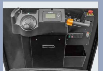
Control and display panel integrated are perfectly in the drivers field of view