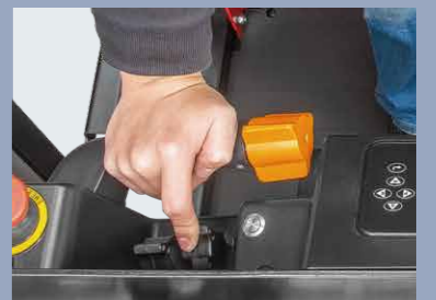
Simultaneous driving/lifting/lowering, simple and ergonomic controls allow precise operation reducing driver fatigue and increasing throughput