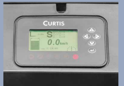
Standard LCD display informs the driver about all necessary informations