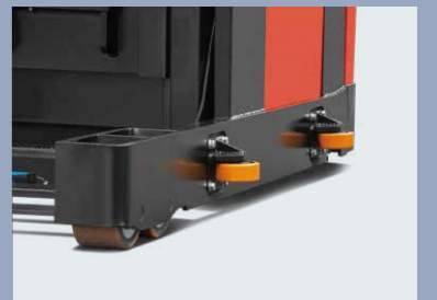
Rail guidance rollers (Opt.) can be fitted to the truck for VNA working