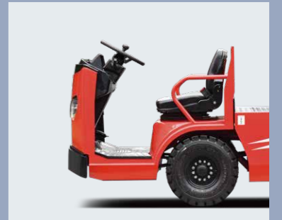
Full suspension operating platform, vibration is reduced, noise is isolated (1.5-5t)