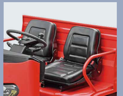
2 operators on board, optimised driving position for maximum comfort and efficiency (1.5-5t)