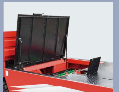
Repair, maintenance and replacement of the battery are convenient and fast, and it is suitable to continuous work