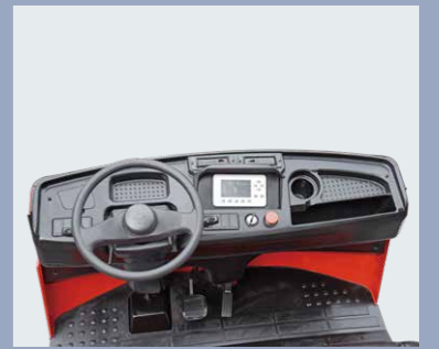
Large screen display, the instrument panel adopts injection molding design, sturdy and durable