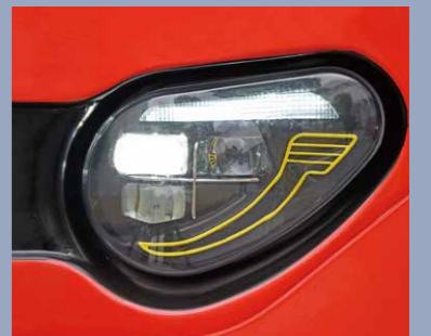
LED headlight has the head light and dipped light functions. The front turn light utilizes the latest stream light technology