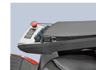
Fingertip system (Opt.)

Note: ● Battery Std. ○ Battery Opt. 2.5Lt:80V