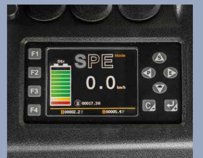
Multi-function instrument with color screen, clear human-computer interaction interface for visualized reading