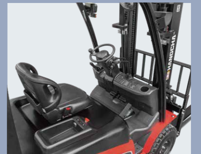
Fully closed operation plate space, tilting cylinder and flat bottom plate, providing more comfortable and safe operation