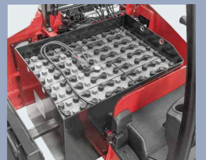
Side roll out the battery can provides the fast, simple and safe solution for the operator