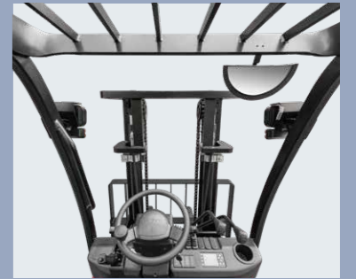
New designed mast and the large open steel roof provide super visibility, it also can reduce risk of accidents