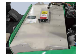
Lithium battery (Opt.)