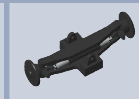
Single double-acting transverse cylinder steering axle, full hydraulic power steering and load-sensing steering gear all can provides easy steering action.