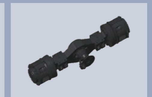
Heavy-duty traction axle with two-stage deceleration; Maintenance-free wet brake; Hydraulic release spring action parking brake provides safe and reliable.