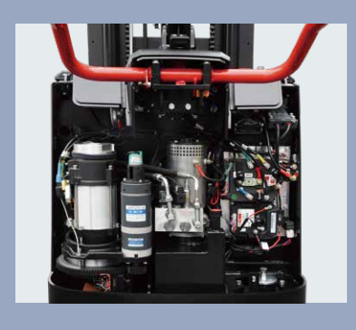
Back cover can be opened fully, and a components and parts are clear at a glance, which is very convenient for maintenance of the entire machine