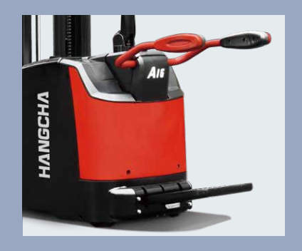
The integrated stamping molded guardra offers better protection for the operator