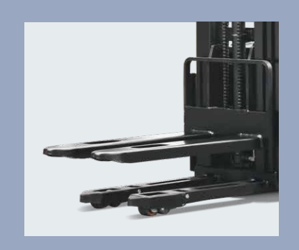
Tandem load whee