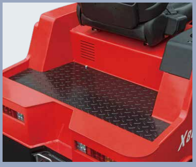
Loading platform, easy to load and unload goods