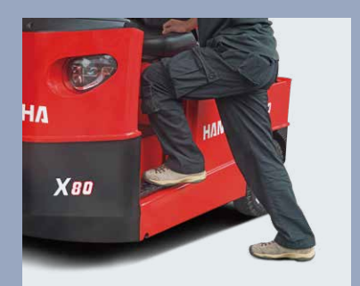
Low-level widely open foot board is very convenient for the operator to get on / off the truck

Upon special design, the traction device can prevent the towing pin coming off during traveling