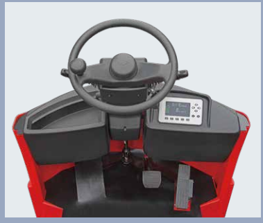
Various operating pedals, instruments, steering wheel, and switches are configured based on ergonomic requirements, and are comfortable and flexible for operation