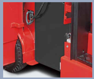
The battery can be removed from truck side, so it is very convenient for battery maintenance