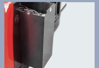
Battery side roll out