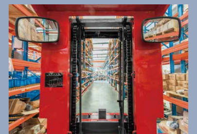
Better vision for operation