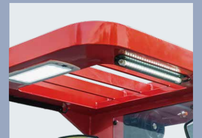
LED top lamp can provide bright operating environment