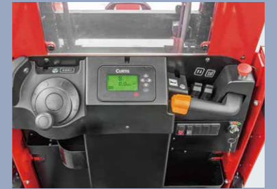
The FREE accelerator lever with sensor switch, as standard configuration, can prevent mis-operation during the work