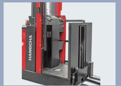
Order picker works only when the side barriers are all lowered