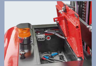
The rear hood can be removed easily to facilitate maintenance work on parts such as hydraulic unit, electronic control system and the motor