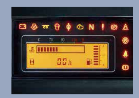
information of the vehicle to facilitate troubleshoot the running status of the vehicle can be monitored