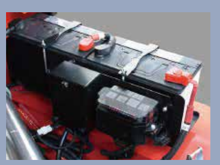
The integrated electrical box can be maintained easily