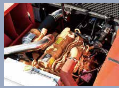
uchai common rail engine