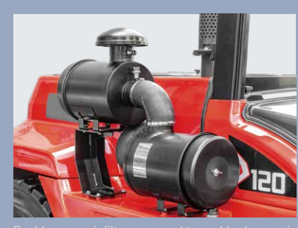
Double paper air filters are used to enable cleane intake of the engine and longer service life of the engine