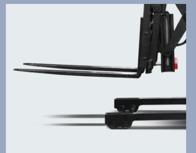
Proportional controlled forks can be operated more accurately