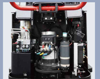
Back cover can be opened fully