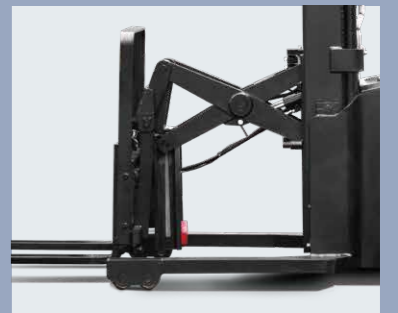
Forks move forward by the scissor structure