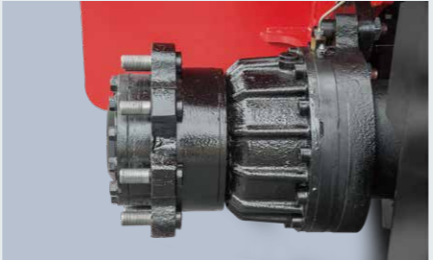
Wet brake offers maximum service life for your brake system.

Along with adopting a low height for the step, it has also been made wider, facilitating frequency entry and exit.